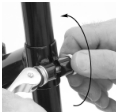
Figure 5c. Adjusting the QR tension.