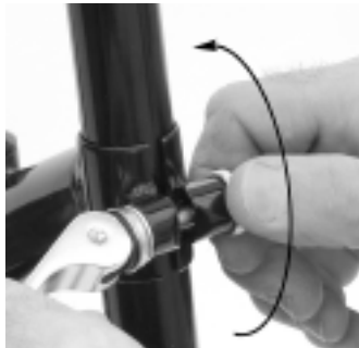
Figure 4d. Adjusting the QR clamp tension.