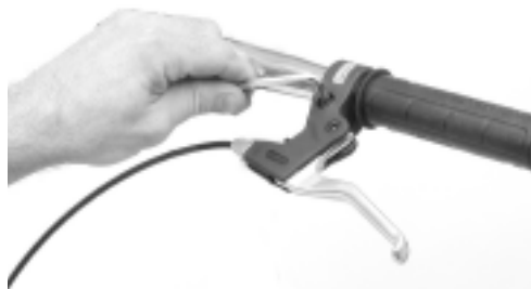
Figure 1. Brake lever adjustment.

Your Electric Punk is fitted with a hand-operated brake. The brake lever may be positioned on the handlebar where it is most comfortable for the rider. To change the position, loosen the clamping screw and slide the brake lever to the new position and retighten securely.