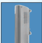
Thin 2.6" Cabinet Design