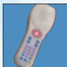
Pillow Speaker Compatible