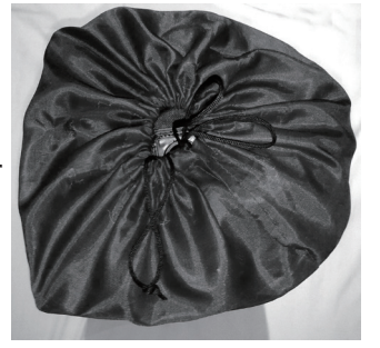
Pack the cot and the sleeping bag as per the Diagram (H).