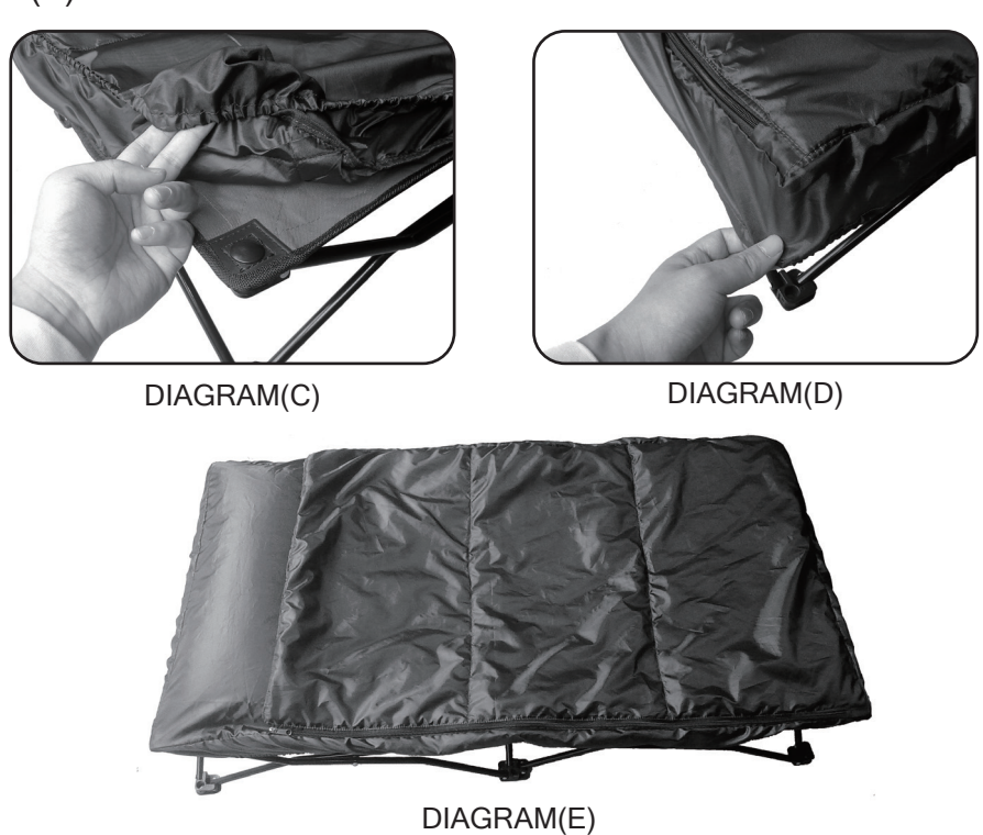
Step 3. To get in to sleeping bag, use side zipper to un-zip sleeping bag, Diagram (F).