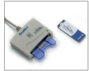
ResScan Data Card* and ResScan Data Card reader*