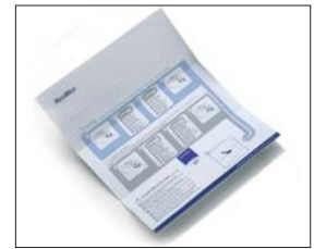
ResScan Data Card mailback envelope*