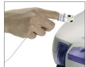
Oximetry option with ResLink

Complementing ResMed's wide range of treatment devices, the ResScan system includes patient management software as well as comprehensive data access options.