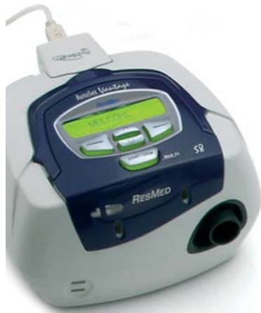
can USB adapter (also available as serial port)