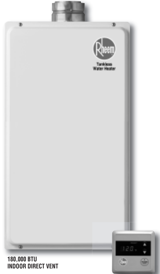
180,000 BTU INDOOR DIRECT VENT