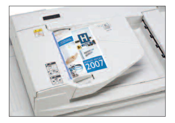
Scan, preview and distribute full-color documents across your organization in seconds with color Scan-to-Email capabilities.