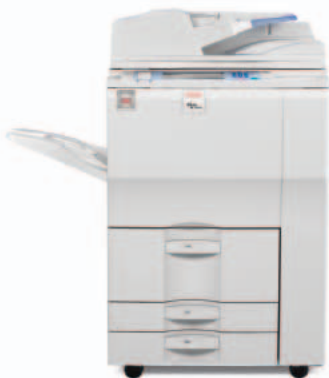
The Ricoh Aficio MP 5500 prints at 55 pages per minute.