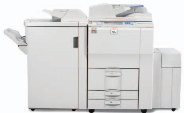
The Ricoh Aficio MP 7500, shown with the 100-sheet Staple Finisher, Cover Interposer and Large Capacity Tray, prints at 75 pages per minute.