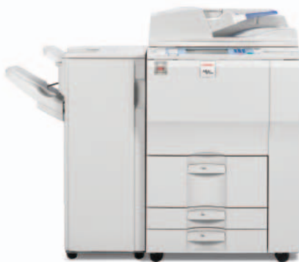
The Ricoh Aficio MP 6500, shown with the 50-sheet Staple Finisher, prints at 65 pages per minute.