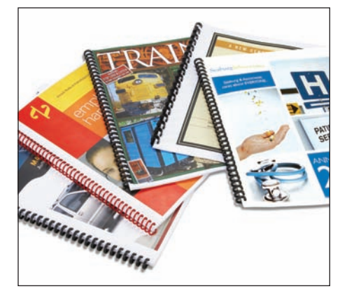
Use the GBC StreamPunch III to produce clean, precisely punched documents in a range of styles.