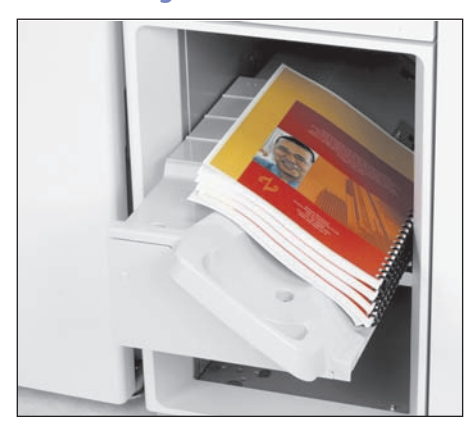
In-Line Ring Binding—with the new Ring Binder RB5000—eliminates the time and expense of inserting binding elements off-line, dramatically saving time and labor.