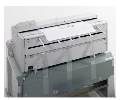
Thick or paste-up originals are fed in a single pass through the FW780's rear feeder.