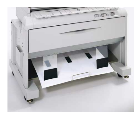
You can make up to 10 copies and deliver them to the front thanks to the FW780's Copy Tray.

You can depend on the FW780 for cutting your copies at the right length. Simply put in your original and it will be cut automatically with the Synchro Cut function. No more manual setting and cutting. Your copies are there waiting when you need them.