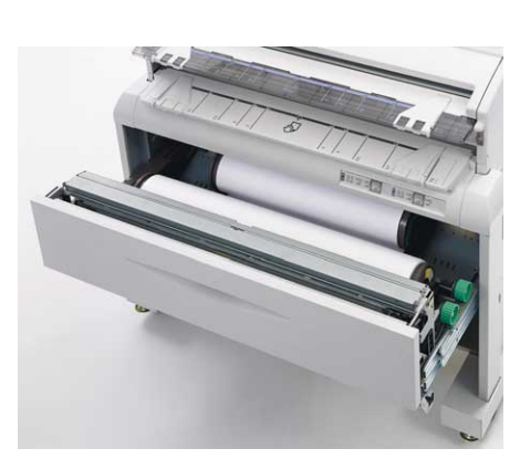
With the FW770/780's optional 2 roll feeder, 2 types of paper are available at the touch of a button.