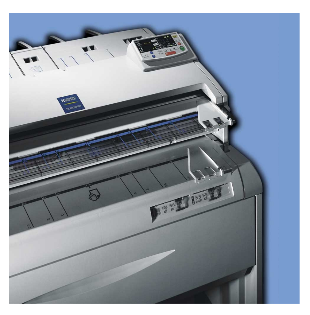
Fast and Top-quality A0 Output from a Compact Design