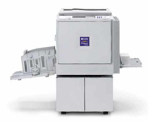
An automatic sensor adjusts print pressure during the run to ensure consistently high print quality.

No one can doubt the impact of colour. Now, with a choice of 11 spot colour inks (including black), the Priport™ JP4500 gives you the power to add cost-effective colour to your documents and other printed materials. A 50% tint mode further enhances colour creativity. In addition, a unique colour matching option allows you to print or copy in your company colour. Furthermore, users can copy two originals onto one page or overlay one on top of another. To highlight specific sections, you can reduce or enlarge images between 50% and 200%.