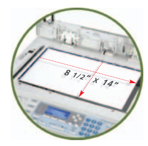
Legal-size platen expands your capabilities to copy, scan or fax large documents up to 8 1/2" x 14".