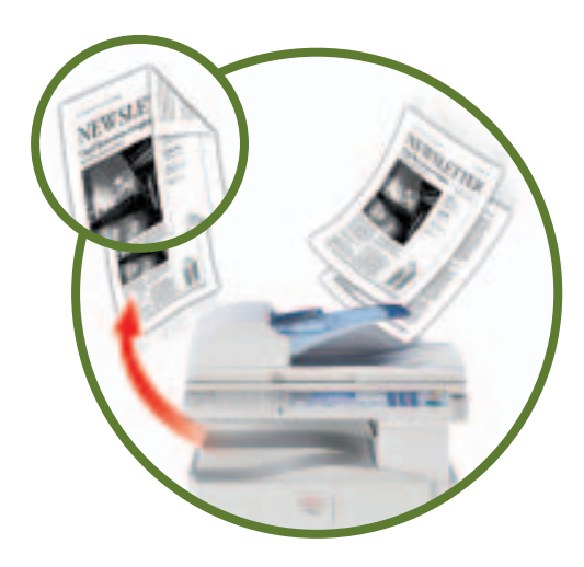
Automatic duplexing can literally cut your paper costs in half by allowing you to copy or print on both sides of a sheet of paper.

Quickly scan your existing color brochures, photos and other documents up to 8 1/2" x 14" and send them instantly with Scan-to-Email or Scan-to-Folder.