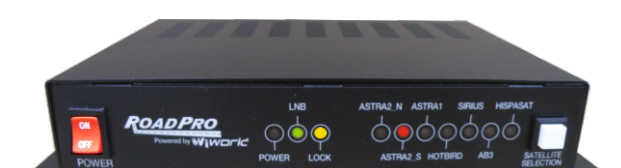
System has confirmed that the selected satellite (Astra 2 south) has been found and has locked on. Turn off power switch.