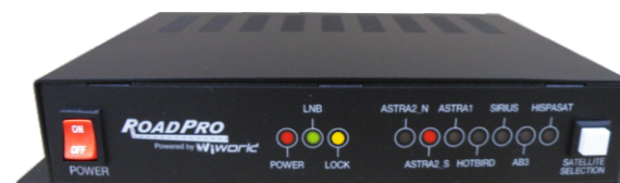
Astra 2 south LED blinks once - the selected satellite has been found.