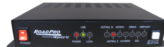
System set to search for Astra 2 south.