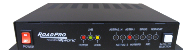
System has found a satellite and will now move to Astra 2 south.