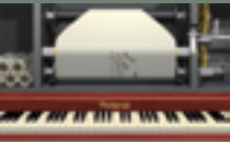
▲ Classic type

Piano Roll plays in sync with the music data. Two types of Piano Roll displays are provided (Classic type: early 20th Century player-piano-like design; Modern type: futuristic music score).