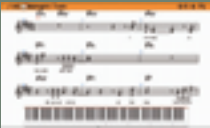
▲ The current playback section of the internal songs / bundled CD-ROM songs can be displayed as music notation on the built-in LCD monitor or to a large TV screen.

Piano Roll plays in sync with the music data. Two types of Piano Roll displays are provided (Classic type: early 20th Century player-piano-like design; Modern type: futuristic music score).