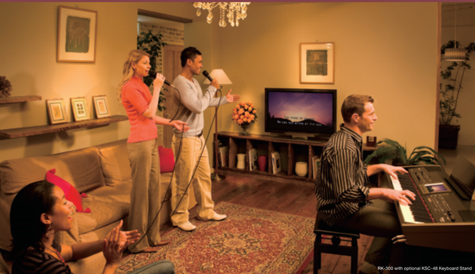
RK-300 with optional KSC-48 Keyboard Stand