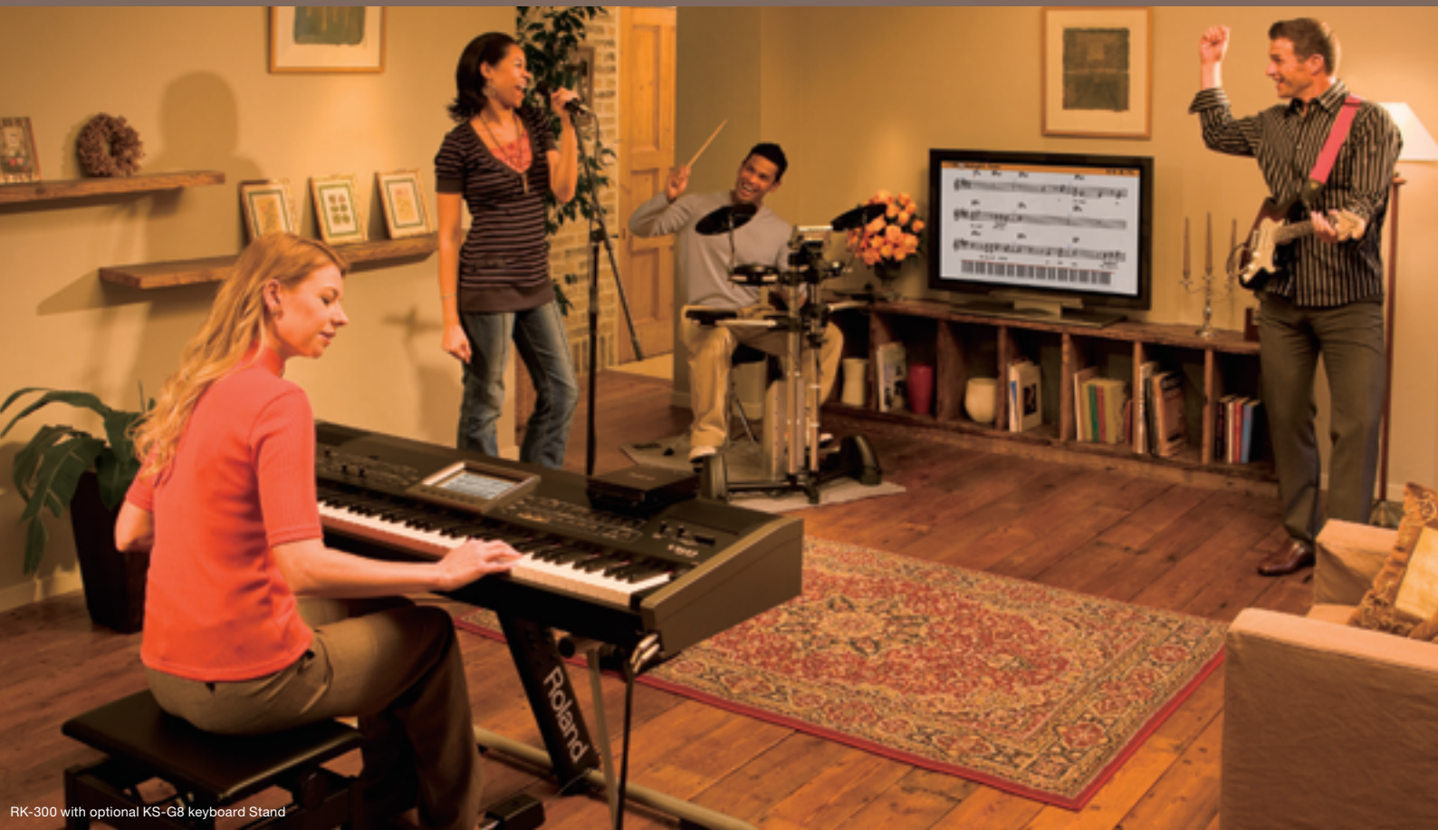
RK-300 with optional KS-G8 keyboard Stand