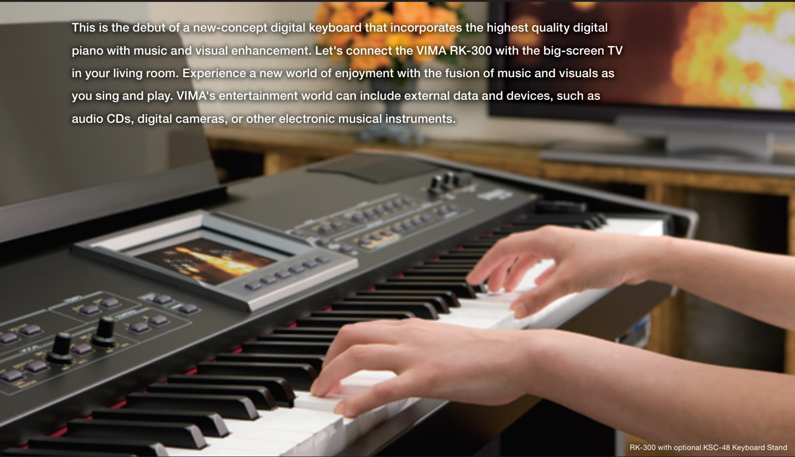
RK-300 with optional KSC-48 Keyboard Stand

This is the debut of a new-concept digital keyboard that incorporates the highest quality digital piano with music and visual enhancement. Let's connect the VIMA RK-300 with the big-screen TV in your living room. Experience a new world of enjoyment with the fusion of music and visuals as you sing and play. VIMA's entertainment world can include external data and devices, such as audio CDs, digital cameras, or other electronic musical instruments.