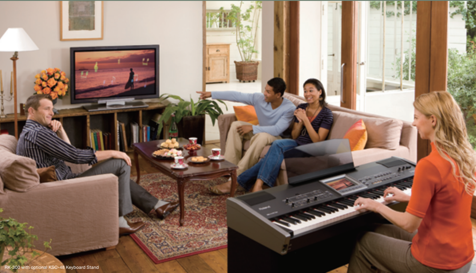
RK-300 with optional KSC-48 Keyboard Stand

RK-300’s convenient lesson-assist features (metronome, recorder, Twin Piano, etc...) can help students master the piano.