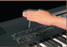
The beam in the photo has been colored to show the path of the D BEAM; the actual beam is invisible.

The built-in D Beam is a unique live performance tool that makes your keyboard performances magical. Your hand movement over the invisible beam can control ANIME effects or the sounds of RK-300, including sound effects such as applause.