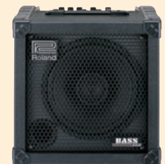
■ Cube-30 Bass