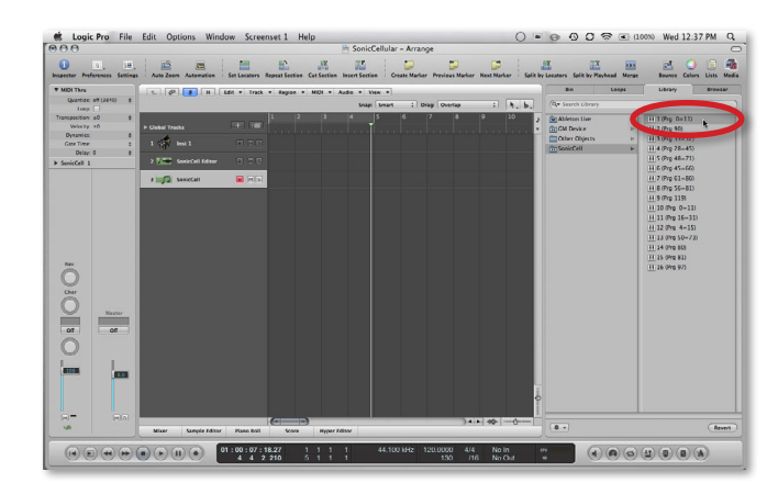
Here we've set our tracks to show their track names, so we see MIDI Program Change numbers displayed next to the MIDI channels in the Library. What you see here depends on how you've configured your track headers.

In the following screenshot, we've selected MIDI Channel 1 because we want to sequence with a patch being played by Part 1 in the current SonicCell performance.