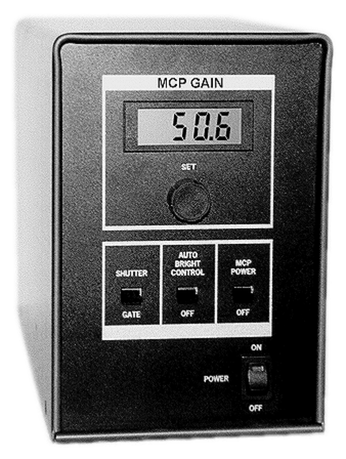
Figure 1. Model IIC-200 Image Intensifier Controller