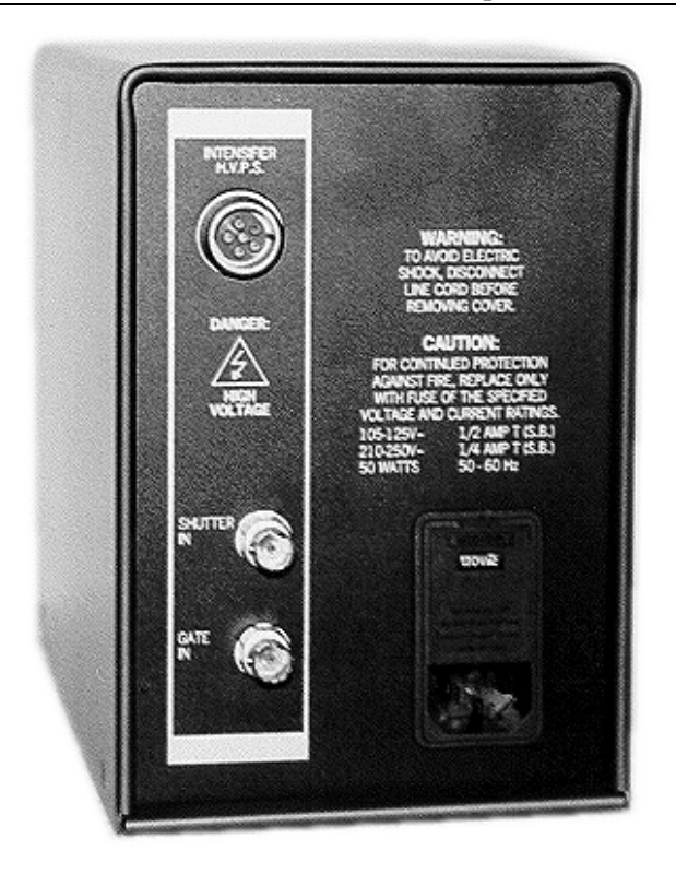
Figure 2. Model IIC-200 back panel

The plug on the line cord supplied with the system should be compatible with the line-voltage outlets in common use in the region to which the system is shipped. If the line cord plug should prove to be incompatible, a compatible plug should be installed, taking care to maintain the proper polarity to protect the equipment and assure user safety.