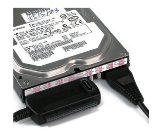
b. 2.5" ATA There is no additional power needed for 2.5" HD.