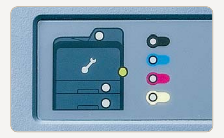
1) Open the door or tray indicated by the LED.

Less downtime affords you greater productivity. The CLP-600 / 650 series is also able to provide self-diagnostic assistance to allow you to try and resolve a problem. Simple paper jam clearance is 3 easy steps: