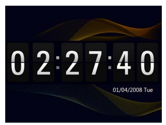
\,\, \,\, If you press the Menu button, the menu of the selected item is displayed on the screen.