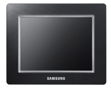
Digital Photo Frame

(The product color and shape may vary depending on the model.)