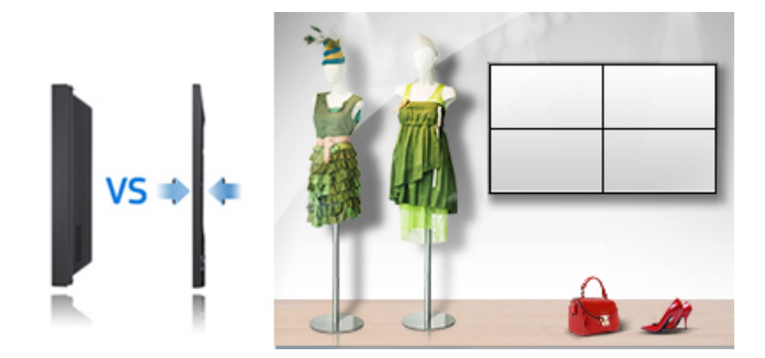
Figure 8. Slim profiles allow installing the displays in narrow areas.

The narrow depth of the UDC, UDC-B and UEC Series of displays allows for placement in tight areas, such as behind counters and display cases. The UDC and UDC-B models offer slim profiles of 96 mm (3.78 in.) and the UEC model has a depth of only 29.9 mm (1.18 in.).