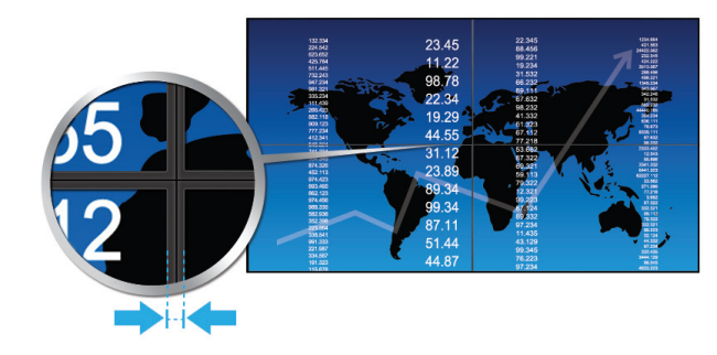
Figure 2. Narrow and ultra-narrow bezels for a more integrated display

The UDC, UDC-B and UEC Series displays feature narrow and ultra-narrow bezels for near-seamless video walls. The UDC and UDC-B models have an ultra-narrow bezel design that enables 5.5mm(0.22 in.) bezel width from panel to panel. The UEC model has a narrow bezel of 11 mm (0.43 in.).