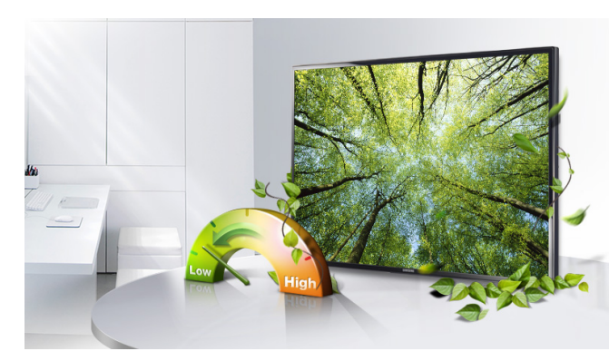
Figure 7. Samsung LED backlight technology

For UDC and UEC Series screens, Samsung technology offers a dimming solution that generates deeper black tones by controlling the LED BLU (backlight unit). The overall picture quality of the displays is heightened, providing a sharp and vibrant image. The backlight dimming technology consumes 30 percent less power than CCFL LCDs, based on an internal Samsung test. The technology is also free of harmful materials, such as mercury or halogen, contributing to a cleaner environment.