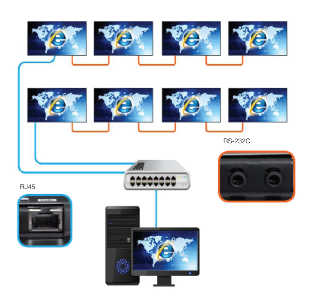
Figure 11. Samsung UDC and UEC LED displays enable RJ45 and RS-232 connectivity simultaneously.

Samsung UDC and UEC LED displays offer powerful connectivity, even when working with RJ45 and RS-232 connections. Competitor displays can operate only an RJ45 or RS-232 connection. With the Samsung line of LED displays, both network connections can be used simultaneously. Using a DVI loop out, a single display image can be shared with nearby displays. This feature eliminates the need to purchase separate video signal distributors for each display, further reducing equipment costs.