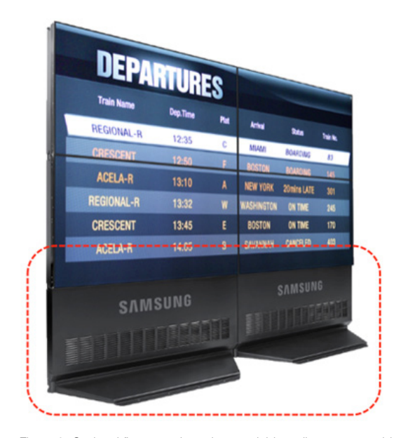
Figure 9. Optional floor stands and expandable wall mounts provide various custom configurations to fit almost any need.

Versatile installation accessories, such as a floor stand, a mobile Internet device (MID) and wall brackets, provide even more display options. Using this modular approach also enables clients to find the exact Samsung LFD to fit their needs cost-effectively.