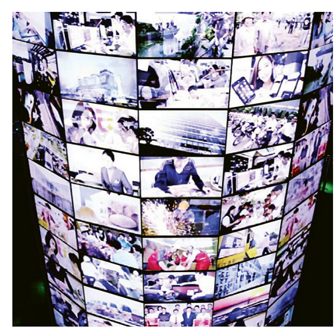
Figure 1. Eye-catching video walls enable users to publicize their goods and services while maintaining creative control