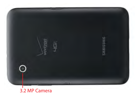
• 3.2MP Camera: Use when taking pictures and recording video.