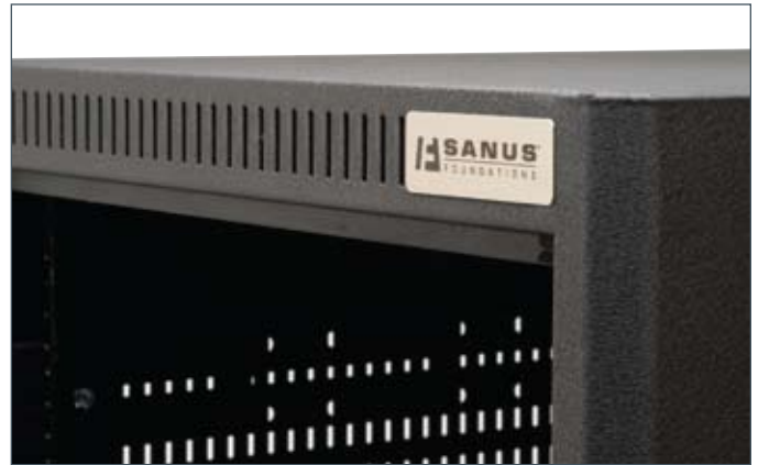
CFR535-B1 vent detail shown

New Foundations Component 500 Series AV racks come open and ready to customize — simply add available accessories for a fully personalized solution. Designed with high performance and structural integrity in mind, 500 Series racks feature heavy-gauge welded steel construction, removable casters for easy access to the rear of the cabinet and adjustable-height feet for perfect leveling and stabilization. Vented side panels allow increased airflow to keep AV components cool, even in an enclosed cabinet.