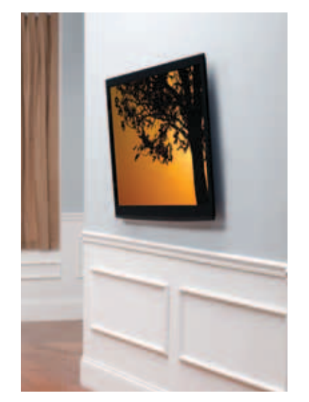
Problem: TV does not appear level with its surroundings.