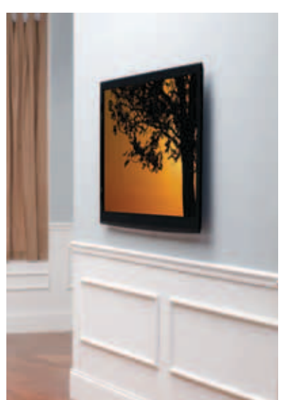
Solution: Exclusive ProSet™ technology allows height and leveling adjustments after the TV is mounted.