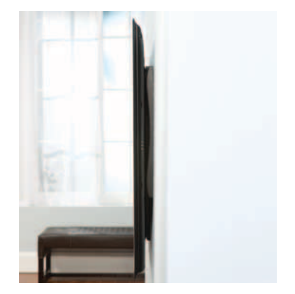
model VLT15-B1 shown