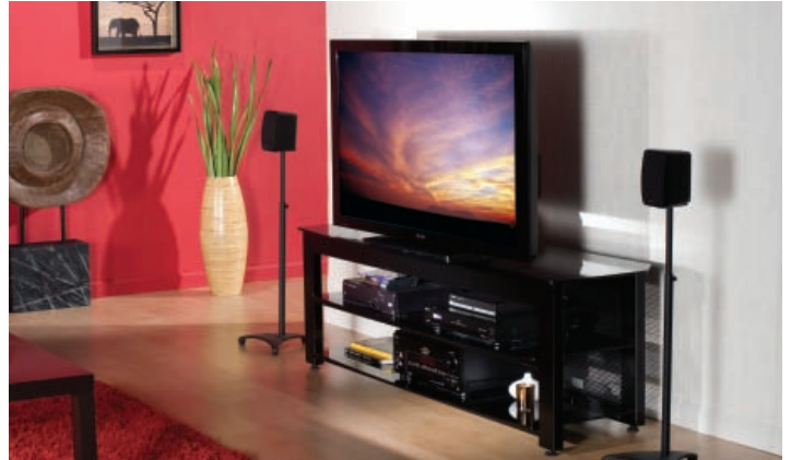
model SFV265-B1 shown

The new Steel Series SFV265 is a lowboy designed to fit today's most popular large TVs and home theater components. This sturdy piece features a high-gloss black finish, three extra-thick tempered-glass shelves that hold up to 100 lbs each and multiple cable management channels to accommodate large AV component arrangements. Adjustable feet ensure the SFV265 is level on any surface, and open architecture allows unrestricted airflow to keep components cool for optimal performance.