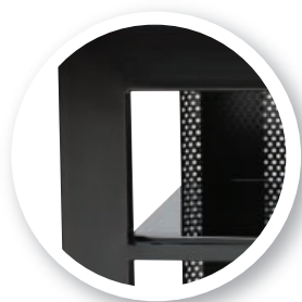
Heavy-gauge steel construction