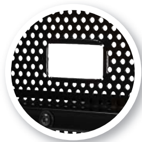
Cable management holes