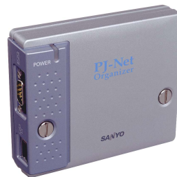
Optional PJ-Net Organizer Model# POA-PN40