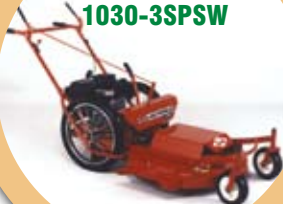
Model 1026-3SPSW 1030-3SPSW

26" or 30" Cut, Powerful 11.5 HP Briggs, Side Discharge, 20" HD-Spoke Wheels, HD-Tires w/ Sealed HD Precision Ball Bearing, Dual Front Swivel Wheels, Plow Style Handles, Quick Height Adjustment, Self-propelled, 3 Speed Peerless Transmission, All Sealed Ball Bearings.