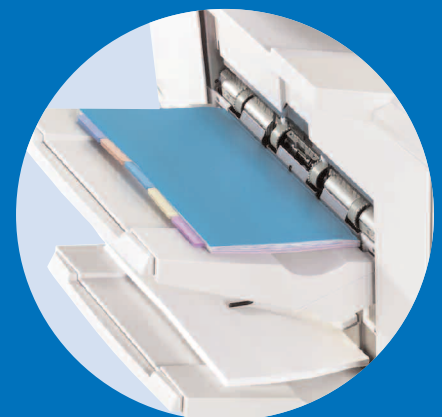
Multiple finishing options provide the capability to create professional, finished documents in-house.