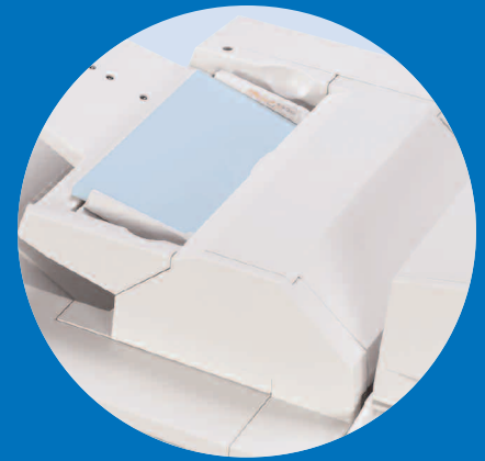
Insert pre-printed sheets as covers and slipsheets with the Cover Interposer.