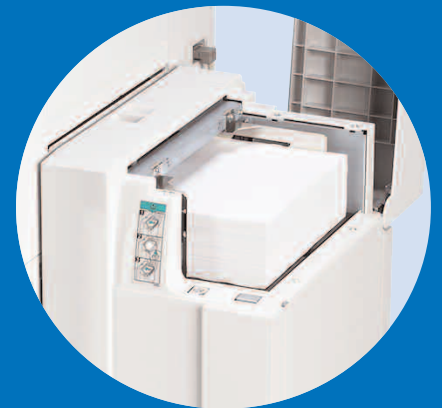
The large capacity tray holds 4,000 sheets of paper, and can be converted to hold 2,500 sheets of 8.5" x 14" with option.