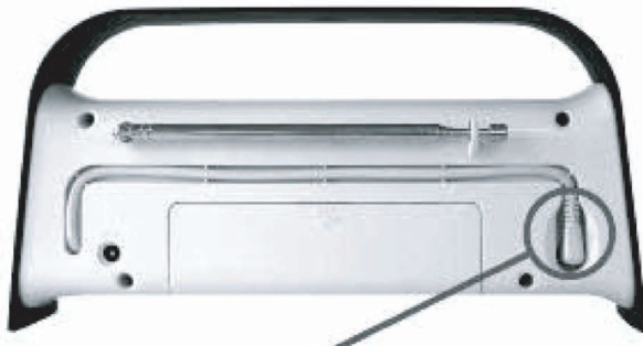
AUX-IN plug with external cable