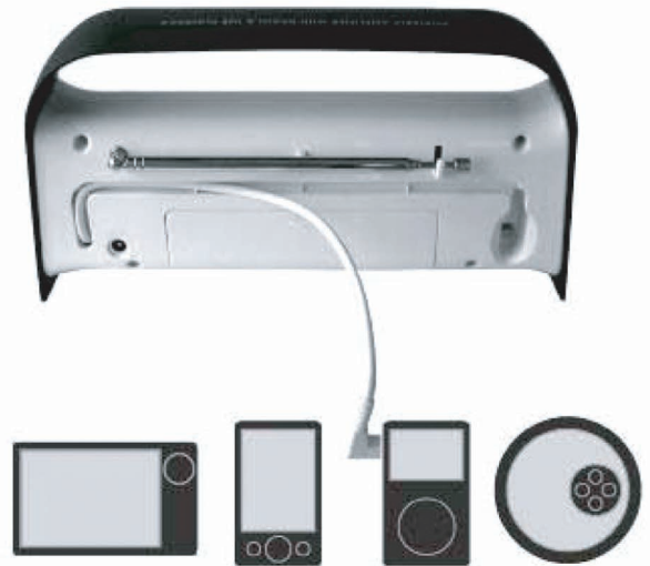
Easily connect your MP3, CD, PDA or iPod® to this unit through the AUX-IN cable with the 3.5 mm plug