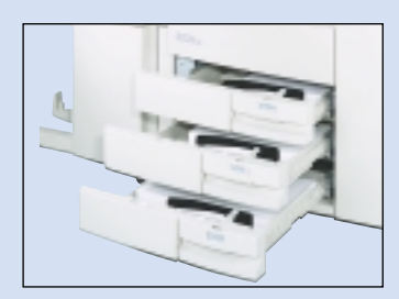
Three 500-sheet adjustable paper cassettes provide paper size flexibility for true versatility.