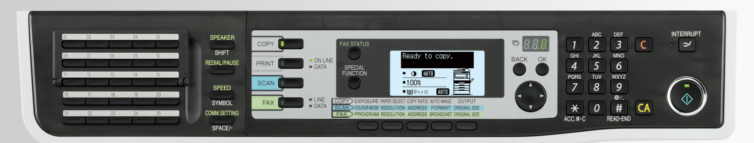
MX-M232D Control Panel.

Maximize capabilities of your MX-M232D with optional full-color network scanning and feature rich network printing! With simple plug-and-play operation, the optional full-featured Network Expansion Kit offers PCL6 and PS3 network printing, walk-up scanning, web-based device management and more. With Sharp's easy-to-use utilities and driver software, the versatile MX-M232D can easily integrate into an existing network environment.