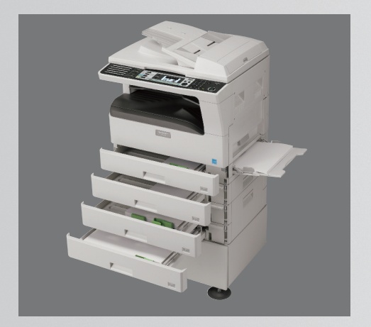
MX-M232D shown with optional 2 x 500-sheet paper feed unit.