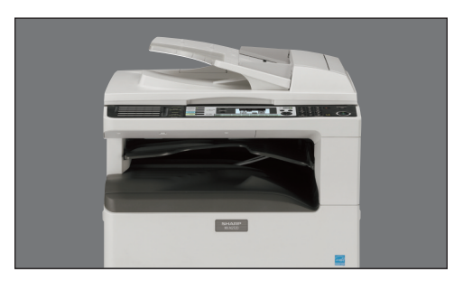
MX-M232D shown with standard 40-sheet Reversing Single Pass Feeder.