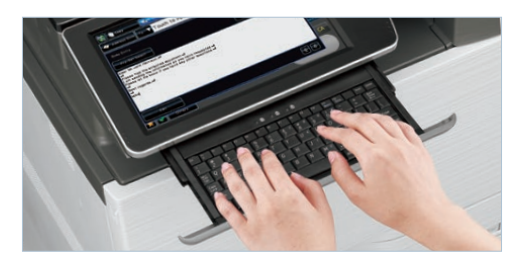
Full-size retractable keyboard simplifies data entry.