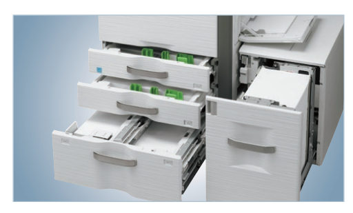
Available paper capacity stores up to 6,600 sheets.