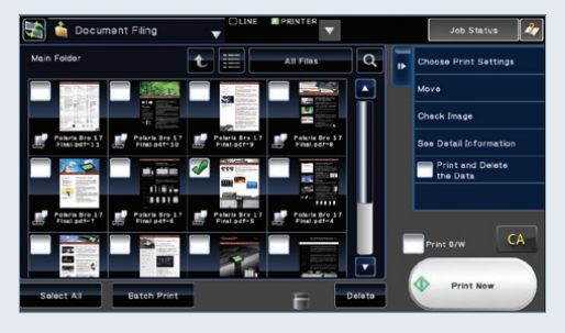
Sharp's Document Filing System with thumbnail preview makes it easy to locate and retrieve stored jobs.