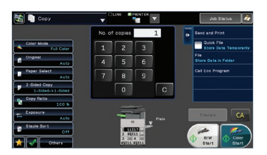
Intuitive copy screen shows options on the left and menu guidance on the right.