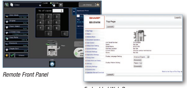
Embedded Web Page

MX4141N/5141N and allows you to locate resources and find information specific to your configuration, truly helping you maximize your investment.