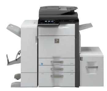
MX5141N shown with saddle-stitch finisher and optional MXLC11.

This series offers a choice of four high-performance finishers that can give your documents a professional look and feel. Choose from a compact inner finisher , a floor-standing 1K saddle-stitch finisher , a 4K saddle-stitch finisher or a 4K stacking finisher. All finishers offer three-position stapling and an available 3-hole punch.