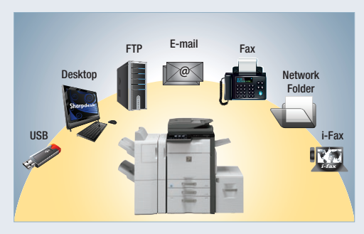
Sharp's integrated network scanning offers one-touch document distribution to multiple destinations.