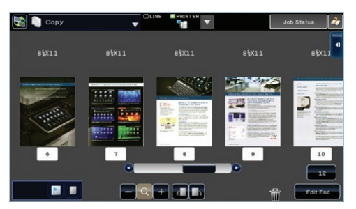
Easily edit documents in scan preview mode.