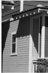
8. Under eaves

To see a complete range of security solutions, please visit www.swannsecurity.com