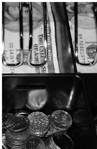
6. Cash register