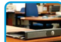
After hours surveillance