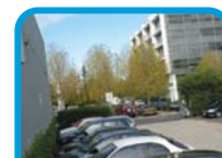
Parking lot security