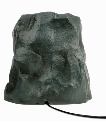
SR601 Rock Speaker