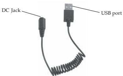
Figure 2: USB Charging Cable