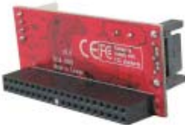
Figure 2: Before sponge