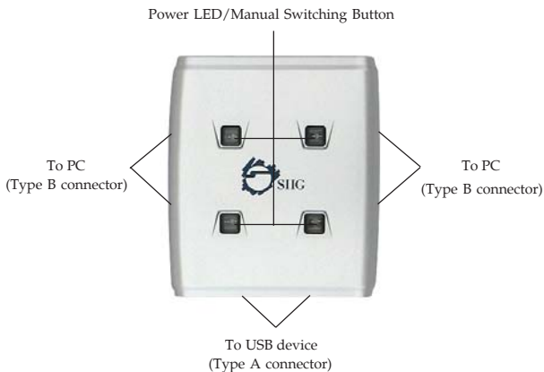
Figure 2. USB 2.0 Switch 4-to-2 Layout