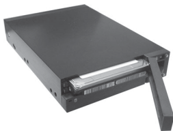
Figure 3: Opening cover