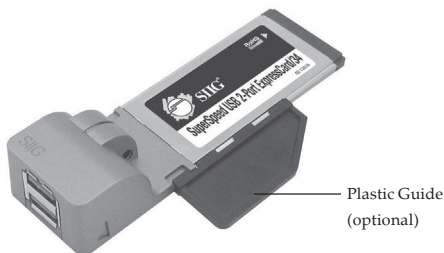
Figure 2: Connecting the Plastic Guide

When inserting the USB 3.0 2-Port ExpressCard/34 into an ExpressCard 54mm slot, we recommend attaching the Plastic Guide , see image below , to the ExpressCard so it doesn't move while inside the slot.