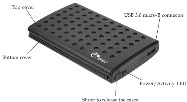
Figure 1: Back Panel Layout