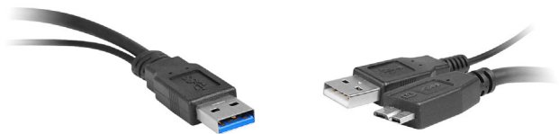
Figure 2: USB 3.0 Y-split Cable Connectors