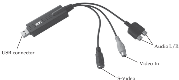
Figure 1: Layout

Note: When using the S-Video connection, you must also connect Audio L/R to hear the sound.