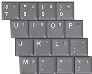
Figure 4: Embedded Numeric Keypad

Note: To return to normal keyboard operation, hold down the Fn key and press NumLock key to turn off NumLock.