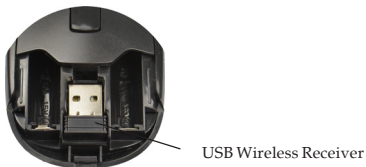
Figure 4: Battery & USB Receiver Compartment