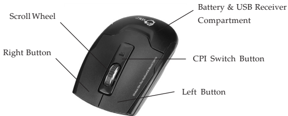
Figure 3: Front Layout