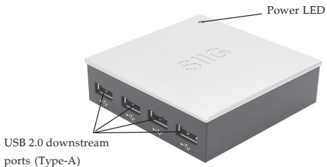
Figure 1: Front Layout