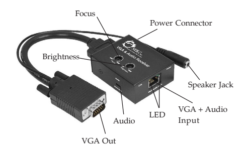
Figure 1: Layout