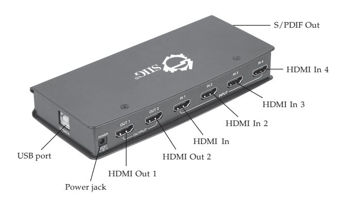
Figure 2 Rear Panel Layout