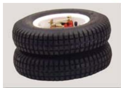
Wheel For Transportation