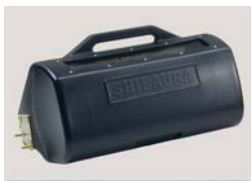
Grass Collector (standard)