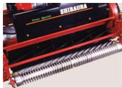
Grooming Roller (standard)