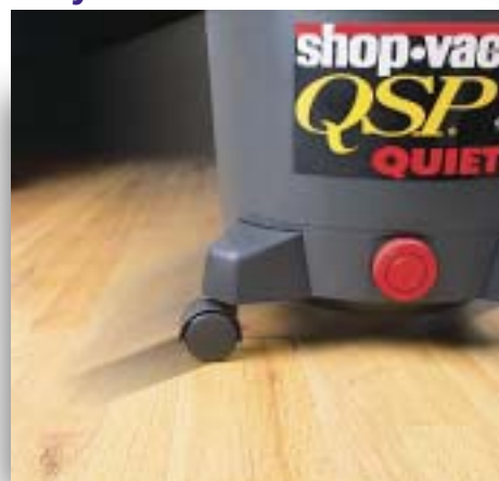
Easy roll casters

QSP® vacs come complete with rugged, rust-proof tanks, a super 3-year warranty, and more than 600 service centers nationwide.