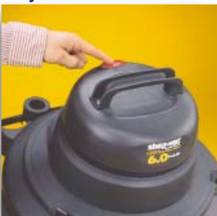
Easy to reach on/off switch