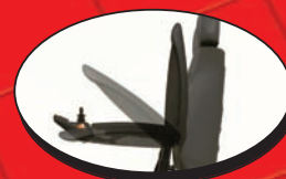
Flip-up arm rest