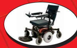
Many seating options available