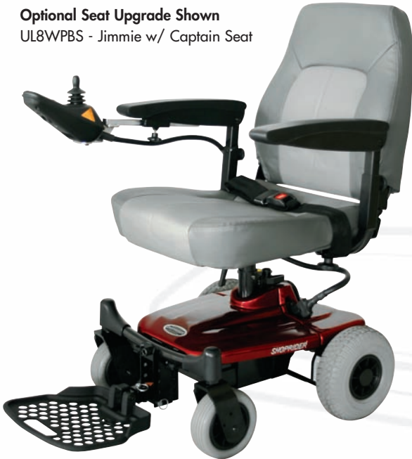
Optional Seat Upgrade Shown UL8WPBS - Jimmie w/ Captain Seat